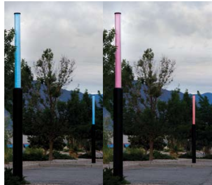
EURO™ Illuminated Vertical Columns