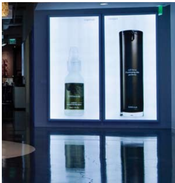
SmartPanel™ Illuminated Graphic Panels