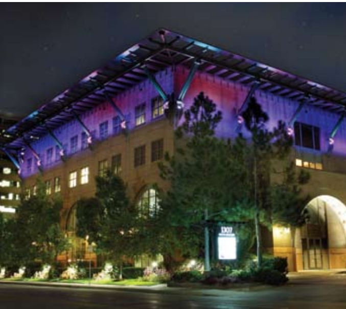
TRE'O™ TEL Series Exterior Architectural Lighting